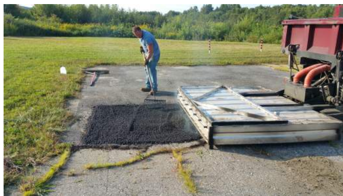
Workers prepare the pavement on the south end turn around

American Infrared for a great job on the runway marking as well as crack sealing and pavement repair. North American Infrared, based in Newport, NH used their infrared machine to repair several areas of deteriorated runway pavement, making previously unusable pavement, serviceable in a matter of minutes.