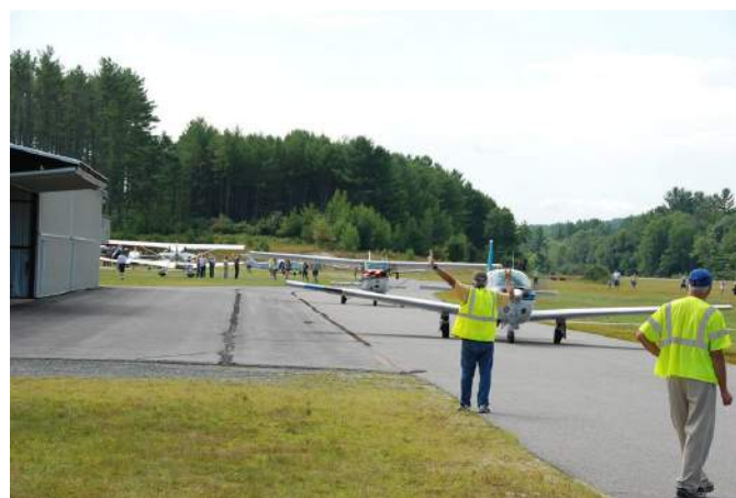
A superb ground crew provided for safe aircraft operations