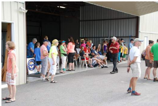
63 kids participated in this year's Young Eagle flights

The highlight of the event for many was the Young Eagles flights provided to local area kids for free through the Experimental Aircraft Association (EAA). Local pilots flew 63 kids this year! Many thanks go out to them for donating their time, aircraft and fuel for this great program.