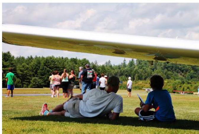
Whiling away the day at Parlin