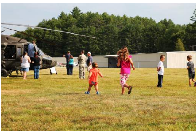
The NHARNG attract kids of all ages

Another favorite at this year's Open House was the UH-60 Blackhawk helicopter from the NHARNG. The aircraft and crew are based in Concord, NH. Their primary mission is to provide search and rescue duties both at home and abroad. The aircrew spent several hours with us explaining the capabilities of the Blackhawk, their mission, and allowing families to board the aircraft and get hands on time at the controls. We thank them for their time and service.