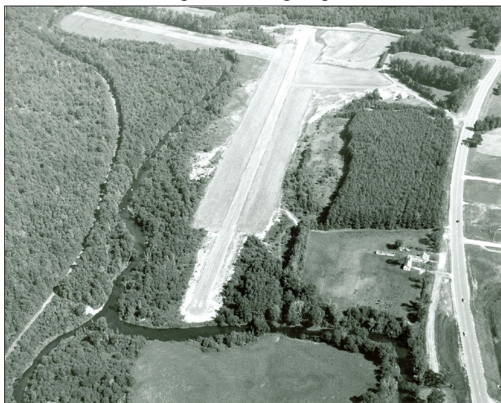
Parlin Field, about 1960? Looking North.

that would eventually become Route 10. Few trees existed along the Sugar River in 1929, and many other areas around the airport were open pasture.