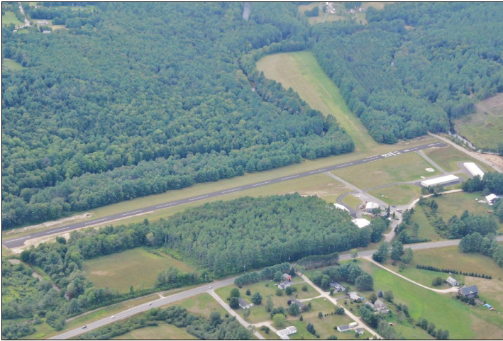
Parlin Field, 2011. Looking Northwest.

The current day Parlin Field preserves the original structures and turf runway, as well as extensions to the paved runway that were added over the years. The airport leases town-owned ground to individuals who built privately owned hangars. The airport also offers